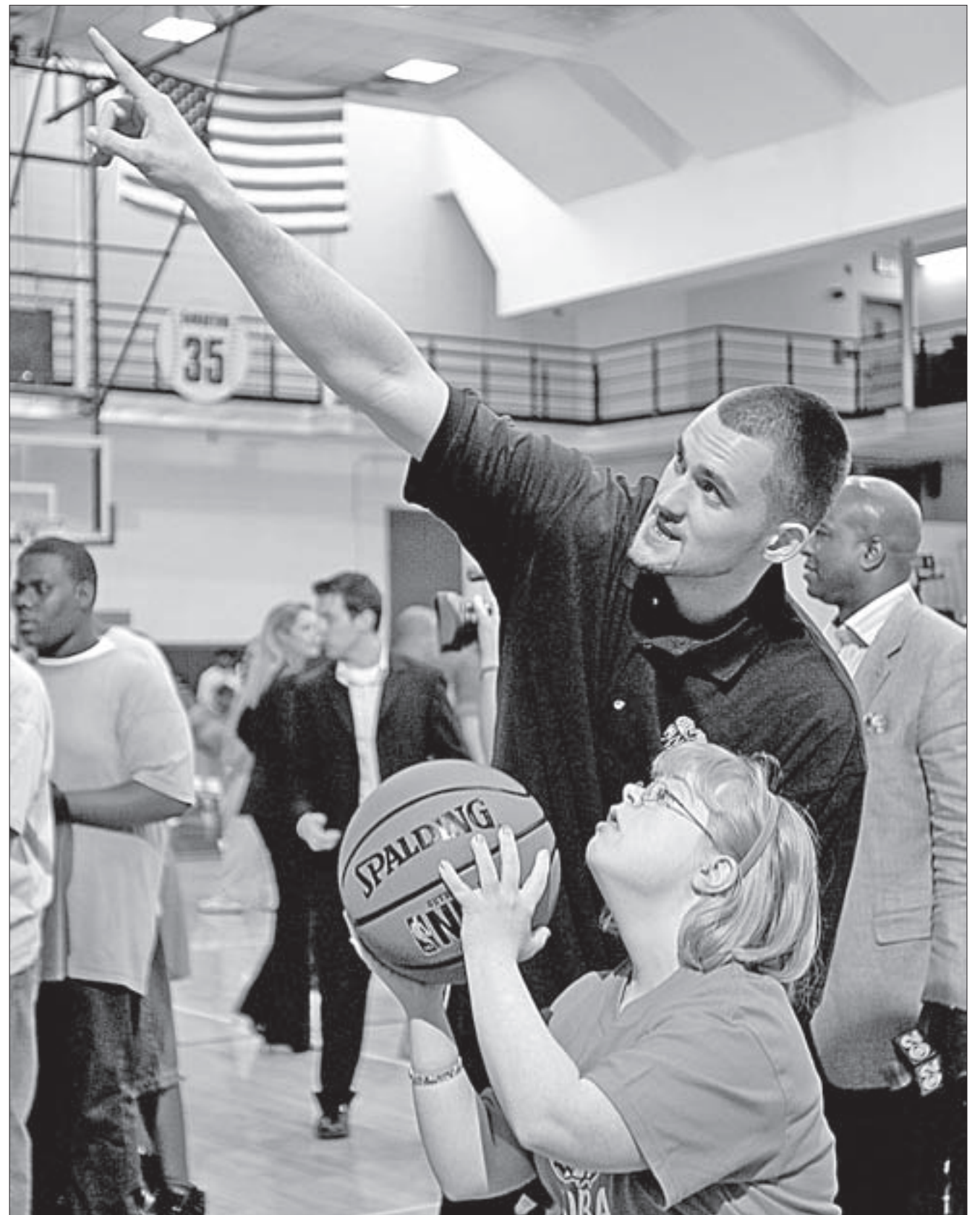
SHOOTING HOOPS: NBA draft prospect Kevin Love of UCLA gives tips to a Special Olympics athlete on the proper way to shoot hoops.