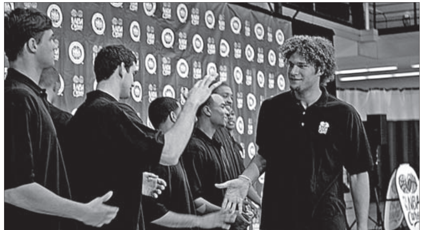
Robin Lopez (right) greets Joe Alexander (center) and Danilo Gallinari (left) after an introduction by NBA hall of famer Bob Lanier at the NBA Care's Special Olympics Clinic on Wednesday.