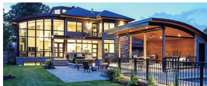
Revelstoke Winner of: Any Room in the House & Green Custom Home of the Year

Educating clients on the benefits of environmentally friendly building is something that RND prides themselves on, because a thorough understanding of the total financial and lifestyle value is still not well-known with most homeowners.