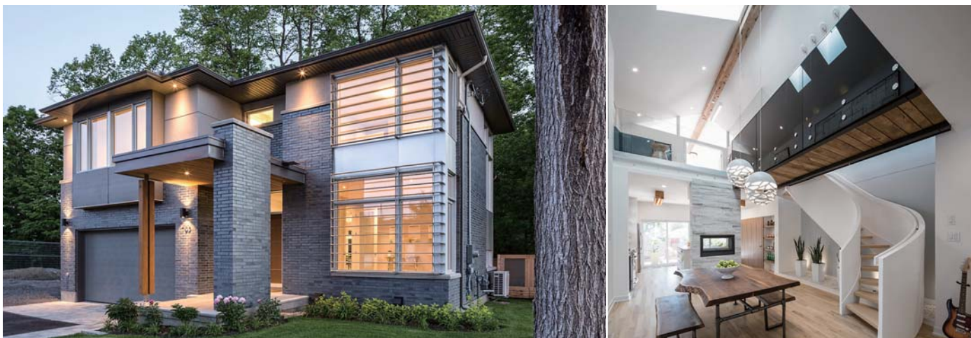
Riverpark Green Winner of: Production Bathroom & Green Production Home of the Year

Although RND Construction has many different offerings, from custom homes to production homes to renovation projects of all sizes, there are common threads running through all of their projects: incredible style, functional design that not only enhances livability but looks sublime, and an intense commitment to the environment, supported by sustainable building practices, design and materials.